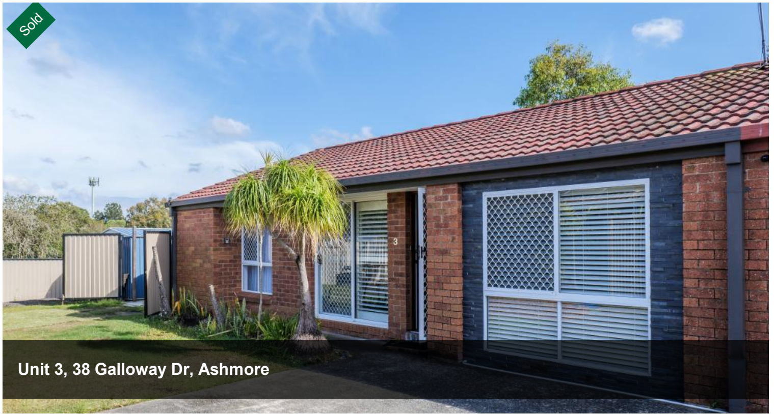
Unit 3, 38 Galloway Dr, Ashmore