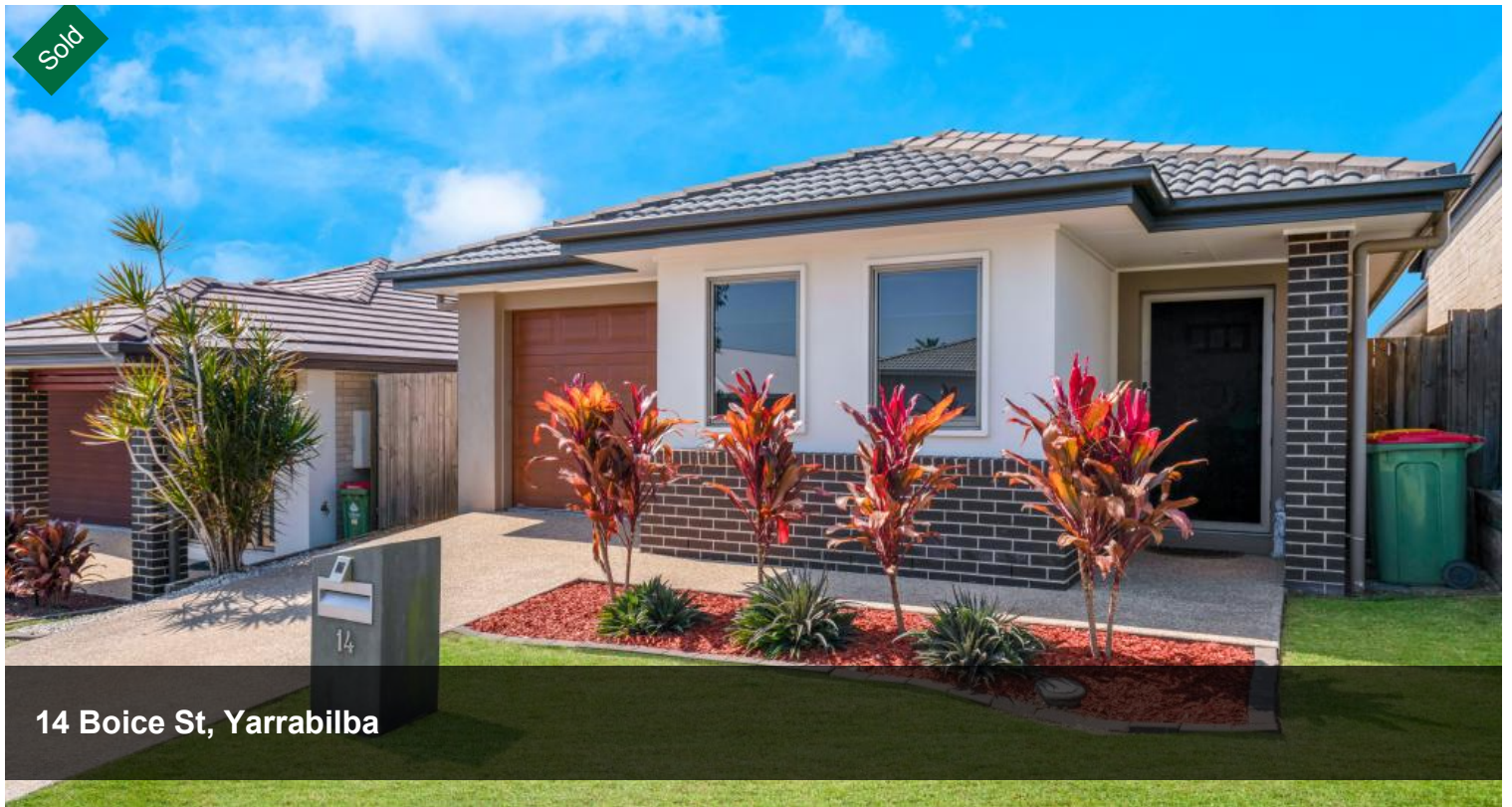
14 Boice St, Yarrabilba